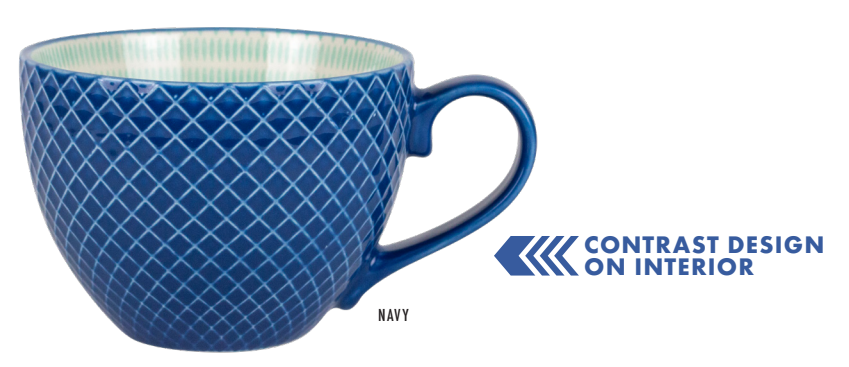
Includes 1 color, 1 location screen or pad print. Set-up and additional run charges will apply.