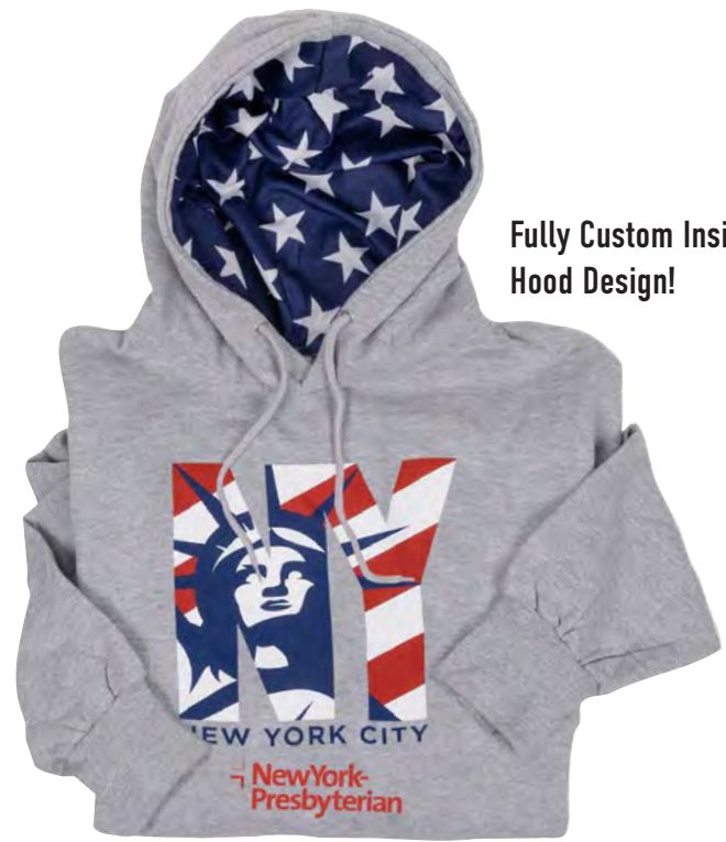
Fully Custom Inside Hood Design!

Setup: $55(G) Production time: 10 Business Days Color: Charcoal, Heather Grey, Navy